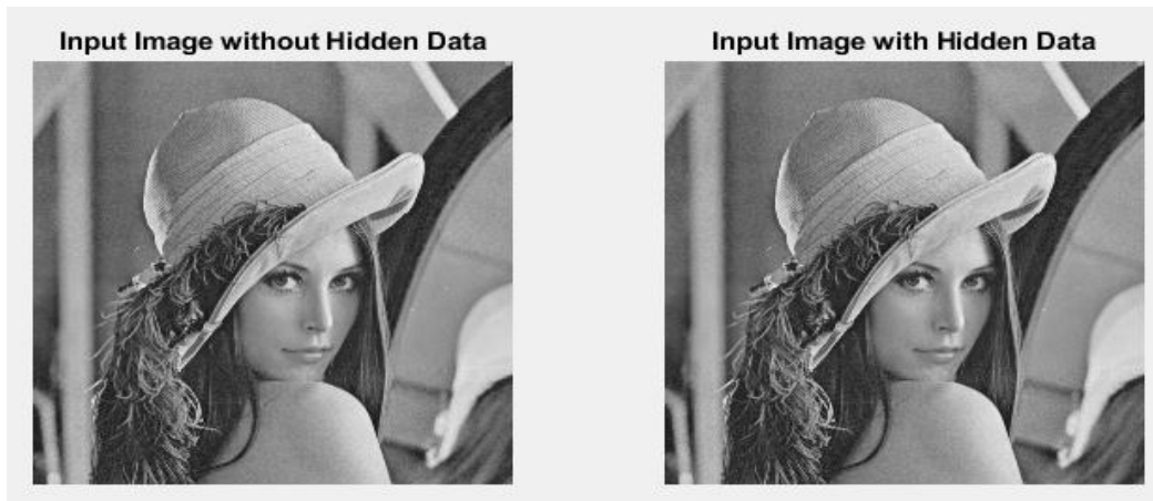
Figure 2: Input image with and without hidden data.

The visual quality for all six images has been preserved, Figure 2 and Figure 3 Shows the visual quality and histogram of Lena image.